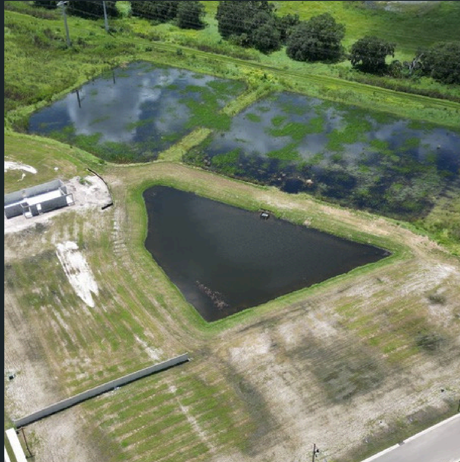
Pond #10 Treated for Shoreline Vegetation.