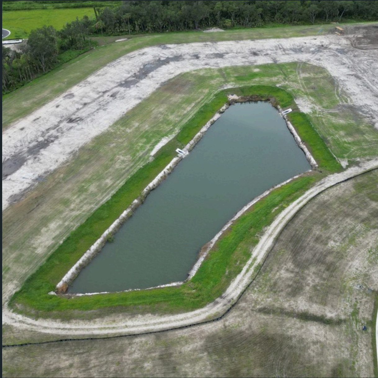
Pond #4 Treated for Shoreline Vegetation.