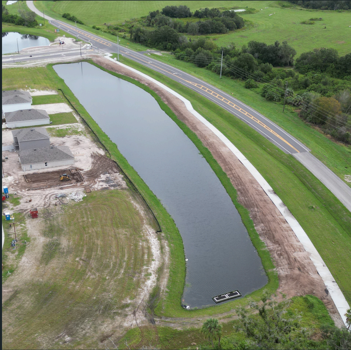
Pond #1 Treated for Shoreline Vegetation.