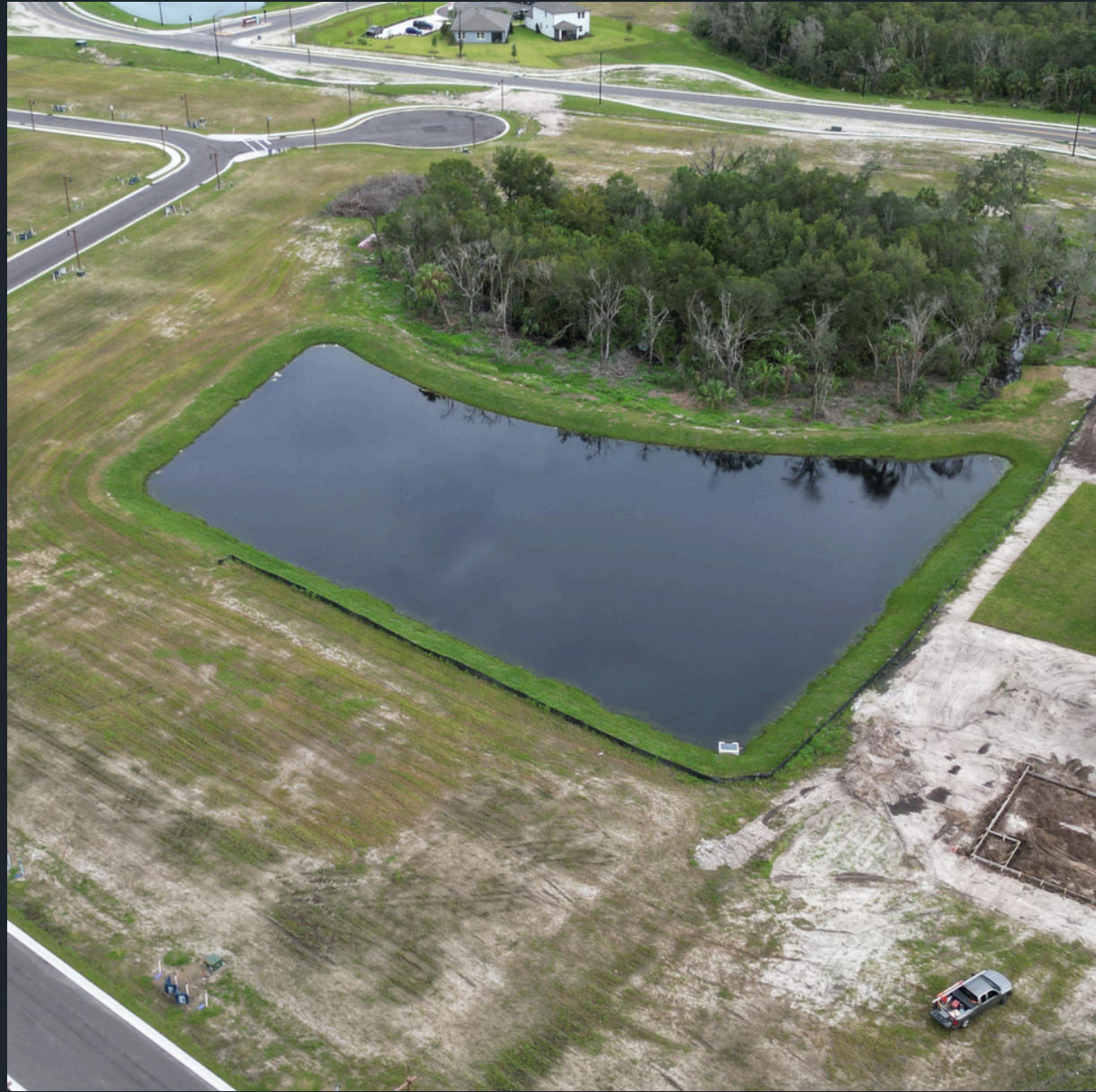
Pond #2 Treated for Shoreline Vegetation.