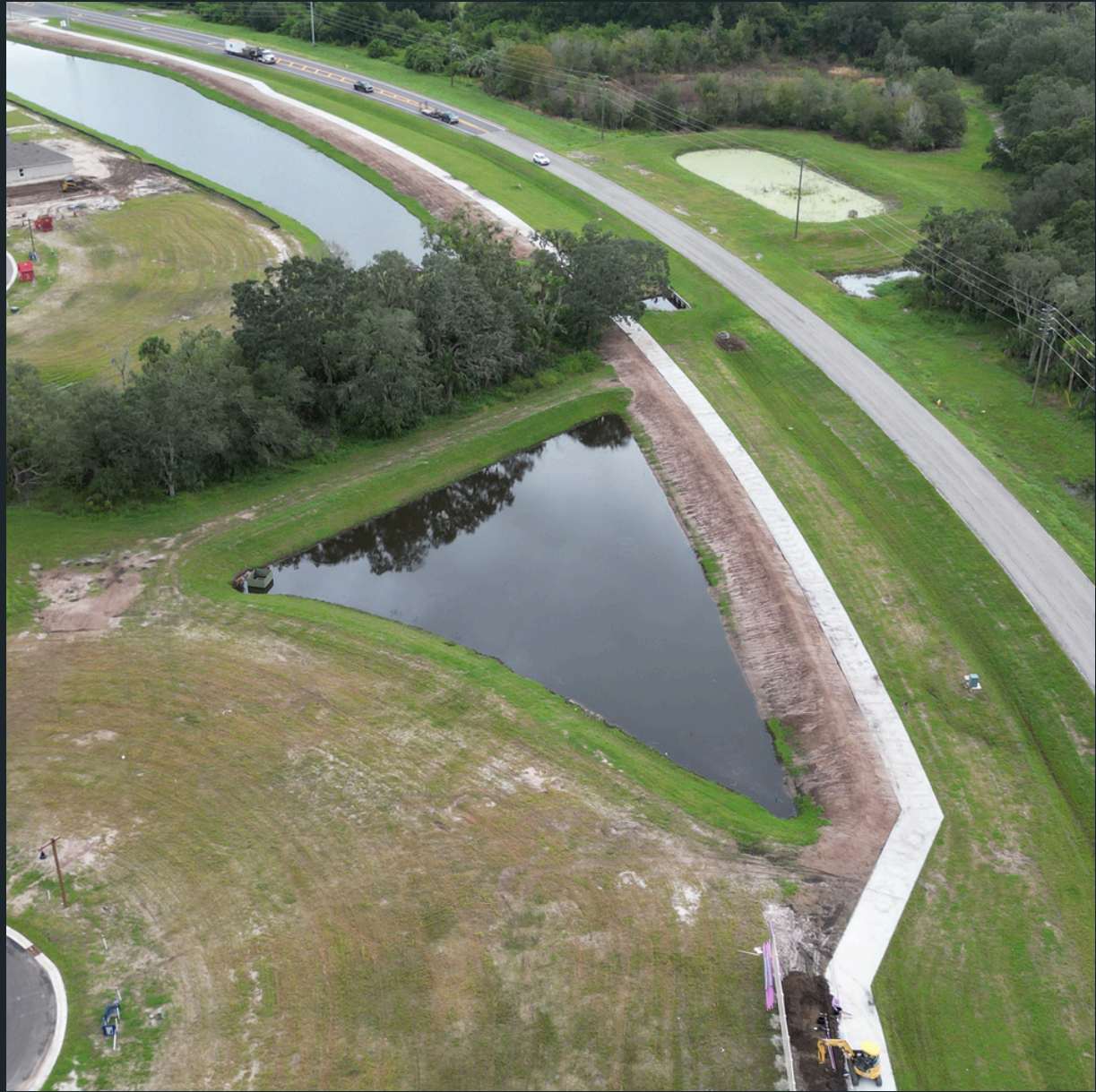
Pond #8 Treated for Shoreline Vegetation.