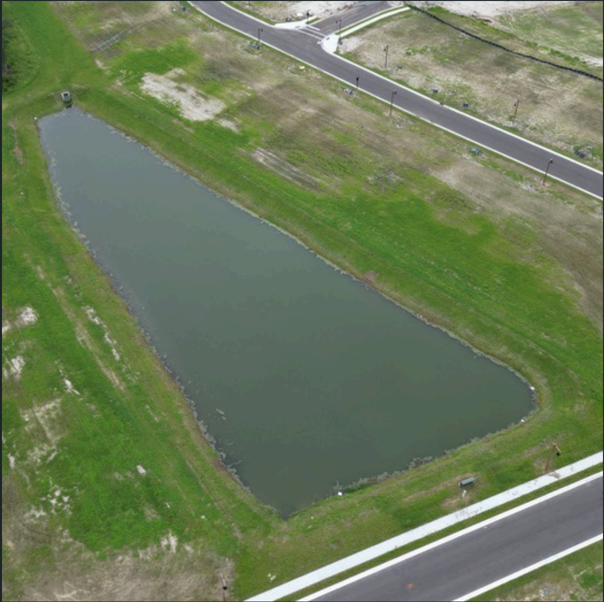
Pond #3 Treated for Algae and Shoreline Vegetation.