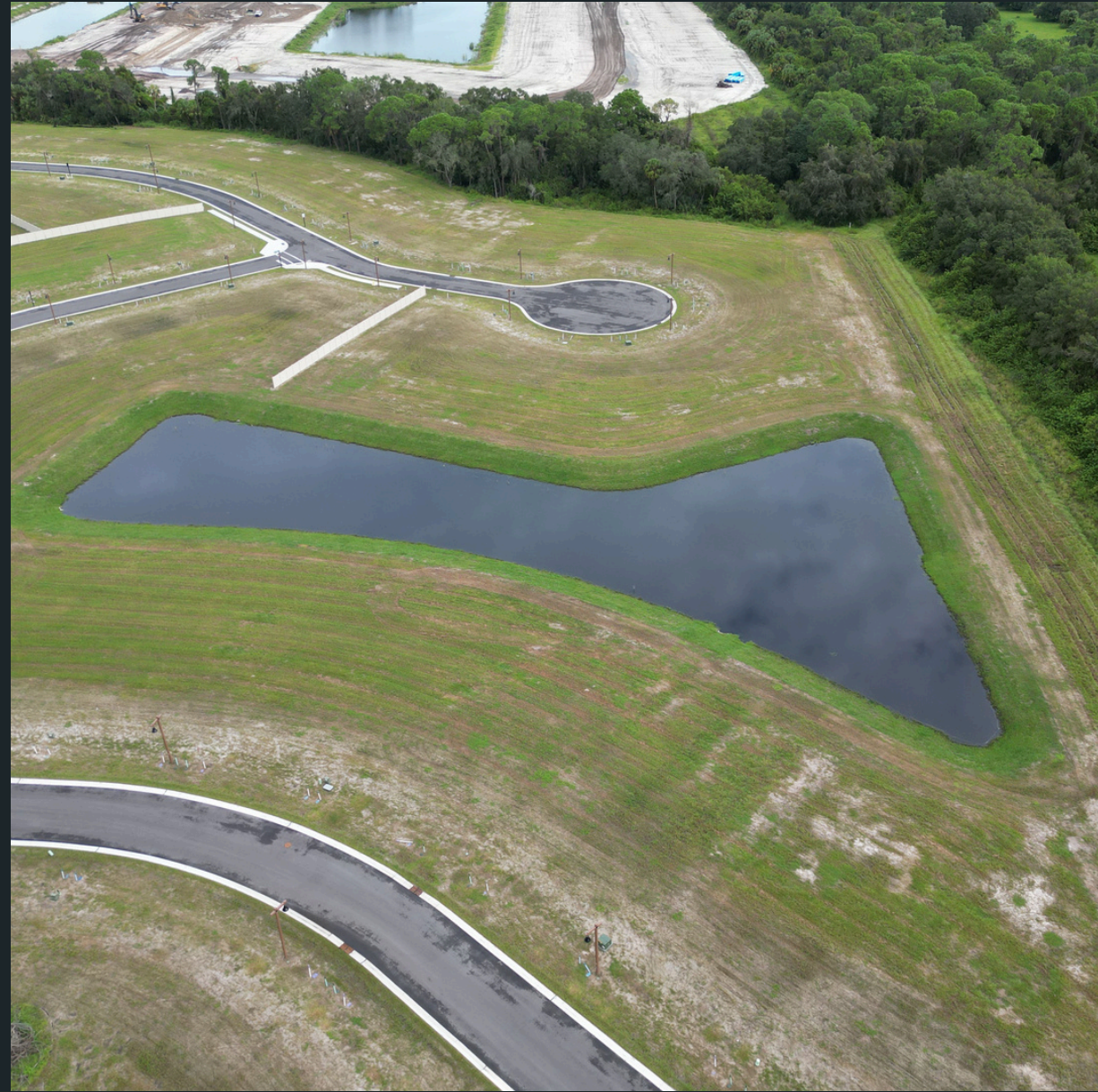
Pond #6 Treated for Shoreline Vegetation.