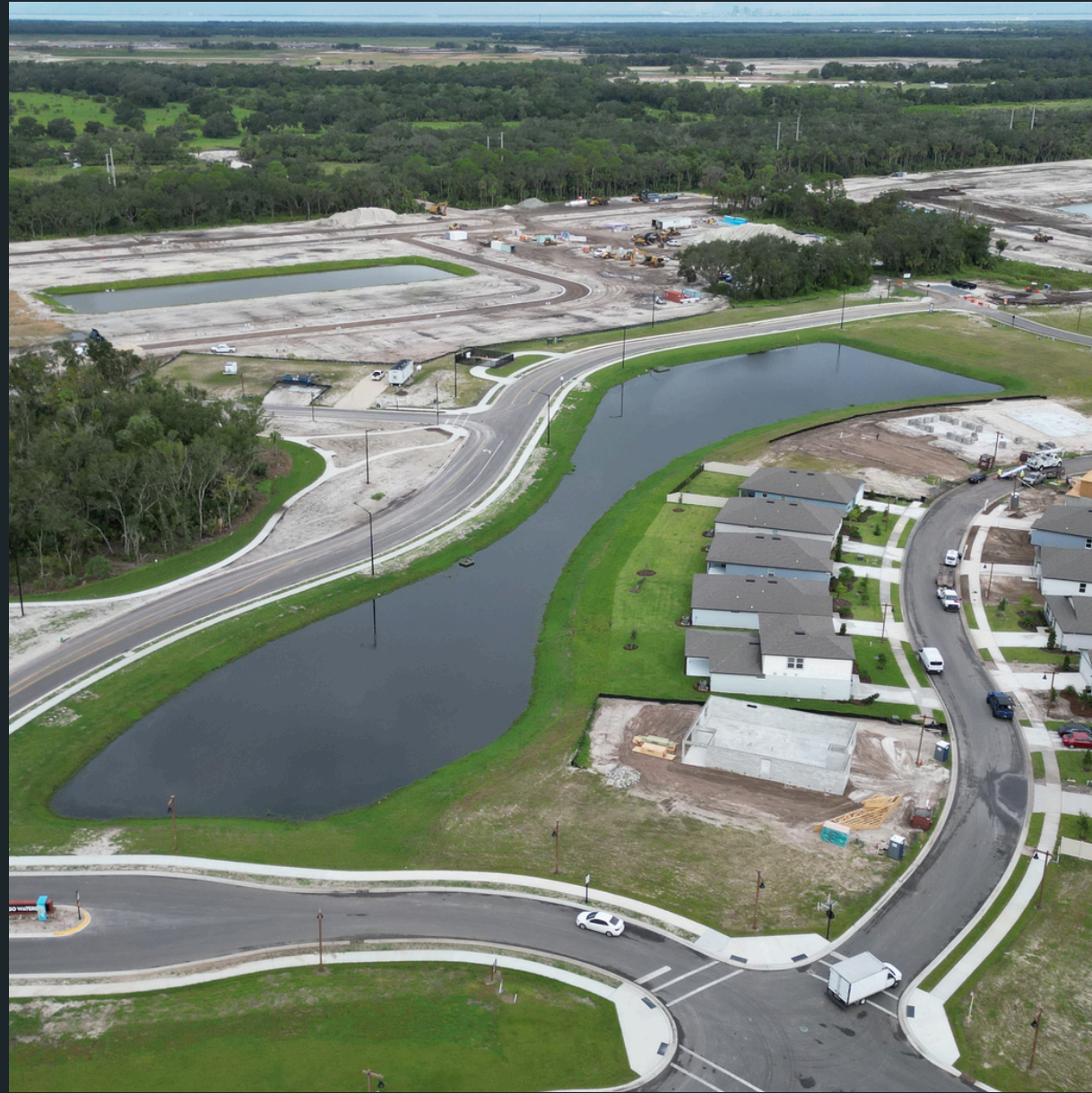
Pond #5 Treated for Algae and Shoreline Vegetation.