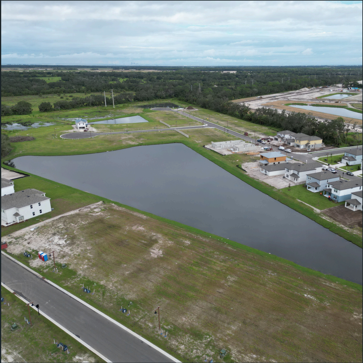
Pond #9 Treated for Shoreline Vegetation.