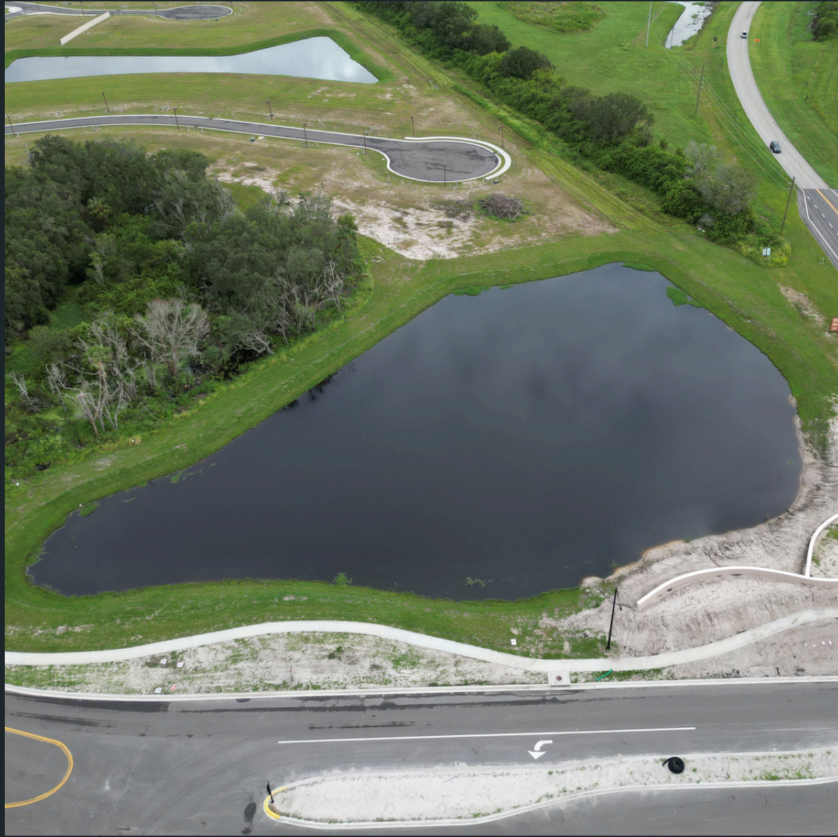
Pond #7 Treated for Algae and Shoreline Vegetation.